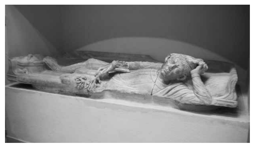
Fig. 5: Sarcophagus of a gallus from Isola Sacra.

well as interpreting this as 'Modius Maxximus (gave this)', we are perhaps invited to read it as '(This is) Modius Maxximus', as an assertion of his own importance as archigallus . Modius Maxximus offers the supreme example of how an individual could appropriate the imagery usually associated with the cult for his own purposes, but the way in which the personal identity of a gallus might be subsumed within the cult is also reflected in a sarcophagus from Isola Sacra, where the exoticism of the deceased gallus is clearly portrayed (fig. 5), and is emphasised further by two reliefs showing him engaging in ritual actions.<sup>39</sup> Overall, then, what we see from inscribed dedications is how they could be used in very personal ways by individuals to express their relationship to and vision of the goddess and Attis.