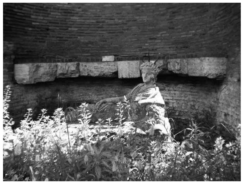
Fig. 2: Apsidal room in the shrine of Attis.

within the sanctuary is much debated. The full results of Spanish excavations in the 1990s, which may clarify some of the phases, are still eagerly awaited,<sup>7</sup> but the general consensus is that the temple of the Magna Mater was built by the time of the Flavian era.<sup>8</sup> Unlike some other temples, such as those in the forum, the location of this temple meant that individuals had to choose to enter the area of the sanctuary, either from the main road or from a minor entrance behind the temple of Magna Mater to the west, and so those who were viewing the objects dedicated there might be supposed to have had an interest and personal involvement in the cult. This would be particularly true of the objects on display in the apsidal room at the rear of the shrine of Attis (fig. 2). It seems reasonable, therefore, to take as a starting-point the hypothesis that viewers of the objects dedicated in the sanctuary would themselves have been actively engaged in the cult.