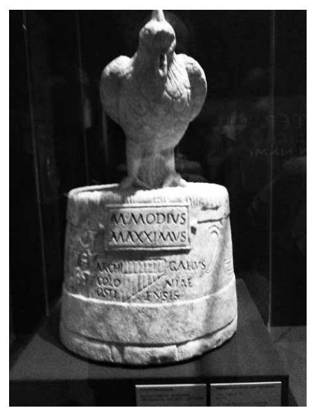
Fig. 4: CIL XIV 385, M. Modius Maxximus, archigallus.

the cult of the Great Mother, but marginal individuals devoted to her cult.<sup>36</sup> Another dedication found in the southern portico of the sanctuary shows how the archigallus (chief gallus) of the colony of Ostia, M. Modius Maxximus, set up a monument that visually punned both upon his name and his position within the cult: M. Modius Maxximus archigallus coloniae Ostiensis ('Marcus Modius Maxximus, chief gallus of the colony of Ostia', fig. 4).<sup>37</sup> Thus we find a modius (corn-measure) surmounted by a cockerel (gallus), and many other pictorial allusions to other aspects of the cult, with the cockerel's tail ending in ears of corn, which also cover the top of the modius, the river-god Gallus (or possibly the head of Jupiter Ideus), a lion's head, shepherd's crook, and the drum, cymbal, and pan pipes whose music must have accompanied many of the rituals. This monument has already been brilliantly discussed by Mary Beard,<sup>38</sup> but I would add a further observation about one particular feature of the inscription, namely its use of the nominative case. In contrast to the dedications made by Euplus whose status as dedications to Attis is made explicit, here there is no dedicatory formula. As