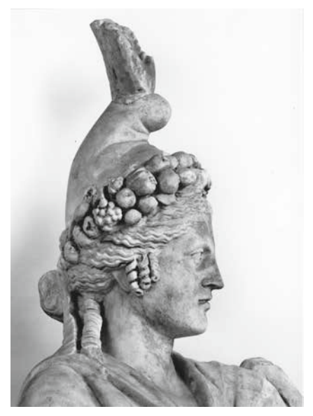
Fig. 3: Statue of Attis reclining.

On one reading of the evidence, then, we may be dealing with an individual, Euplus, who had no official role in the cult, but who repeatedly set up dedications depicting somewhat idiosyncratic interpretations of Attis in particular. It is in this context that the repeated phrase ex monitu deae ('on the goddess' instructions'), becomes important, and could take on different meanings. On the one hand, it asserted Euplus' acknowledgement of Magna Mater's power and authority, especially if he was responding to messages from the goddess on more than one occasion.<sup>31</sup> On the other hand, it also potentially lent authority to Euplus himself, as one who had received a communication from the goddess herself. In this way, another significance of the phrase ex monitu might be to assert the acceptability of what might otherwise have been contested images. It is perhaps no coincidence that the three idiosyncratic representations of Attis as Apollo, Attis as Dionysus, and Attis as polysemic deity with Serapic elements were all described as having been set up on the goddess' instruction. In these cases, the inscriptions made an important contribution to the multiple meanings of the objects, in validating Euplus' vision of the deities concerned, in asserting his line of communication to the goddess, in identifying him as the donor of these gifts, in demon-